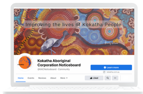
January 2022 - Facebook